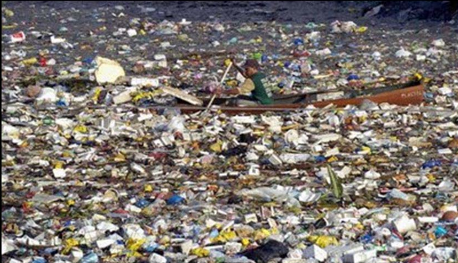
Photo of Pacific Ocean Year 2004